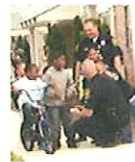
Serving the Public Housing Residents of Sierra Vista Homes, Conway Homes, Tracy Homes, and Thornton

Local law enforcement is available to the residents of public housing to assist them with law enforcement issues. The officers are committed to working with our residents professionally, courteously, and confidentially to ensure our neighborhoods are safe.